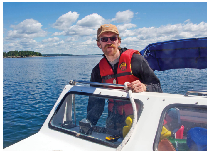
The Fundy Baykeeper, a member of the Waterkeeper Alliance, was added to the Conservation Council's Marine Program in 2003 to conduct on-the-water research and monitoring in the Bay of Fundy, remove large debris from the water and coastline, and work with community members and fisheries groups to promote a healthy marine environment.