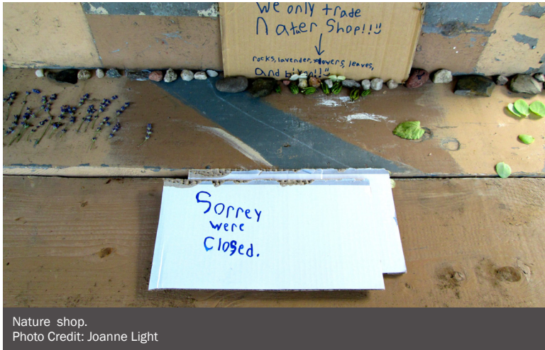
Nature shop.

“Do you want to trade nature?” my landlord’s five year old grandson asks me as I prepare to bike to mail a letter to the premier asking why the Nova Scotia Department of Environment refuses to activate a $350,000 Environmental Trust Fund of the peoples’ money languishing in their books.