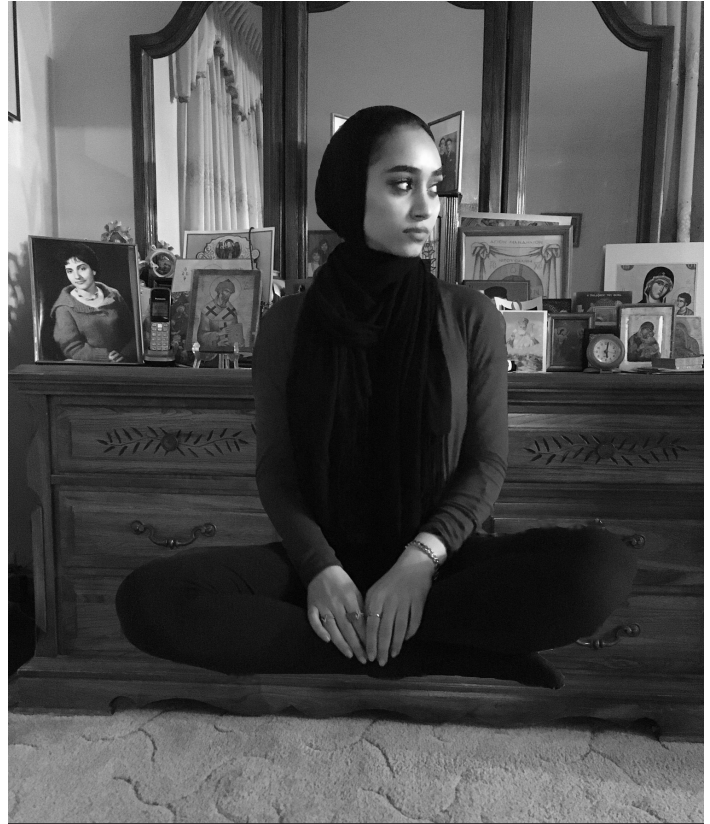
Levitation

Funding in part was provided by ACIC’s Members Public Engagment Fund.