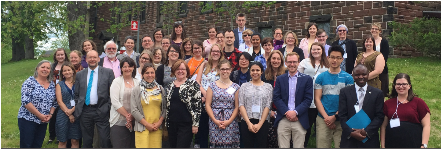
ACIC Symposium participants, Sackville, NB